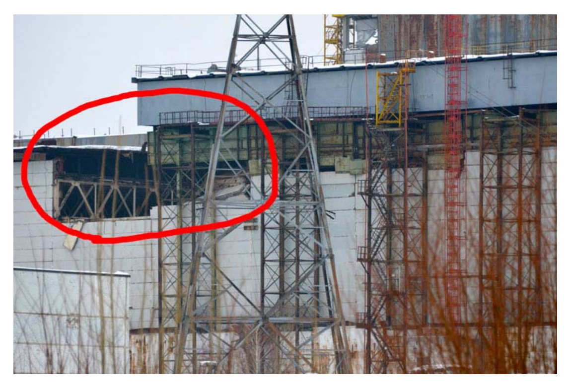
External view of the destroyed area of the turbine hall.

The available information leads to the following key conclusions: